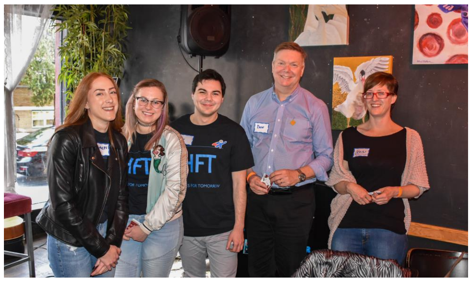
Heroes for Tomorrow at WISE fundraiser, 2018

WISE worked with a number of great volunteers this past year: