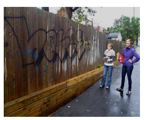
Community Safety Audit

Our audits have been conducted in various kinds of environments from large neighbourhood sectors, to small alleys, to apartment building interiors and exteriors, to underground garages or recreational pathways. We've audited the bus stops on local streets and major stations along the transit way and the O-Train stations. Find the results from these audits in a series of reports on women's safety at transit stations. Call our office to secure copies.