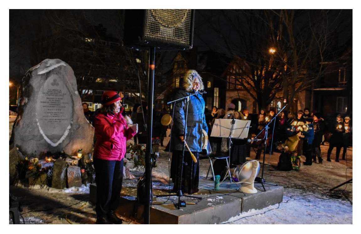
A Minwaashin Lodge drummer addresses the December 6 vigil, 2018

The Vigil in December is organized so that we can remember all the women from our communities who have lost their lives due to senseless violence by the men in their lives. We also remember the women from the École Polytechnique – Montreal massacre.