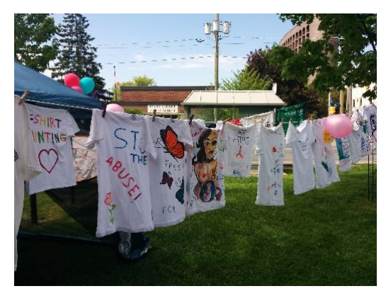
Clothesline Project in Minto Park, 2018

WISE is proud to continue to be part of the public education events organized by Women's Events Network (WEN) including: the ClothesLine Project, Take Back the Night and the December 6 Vigil. Each event is designed to heighten public awareness about the issue of violence against women and how we all can work together to stop it.