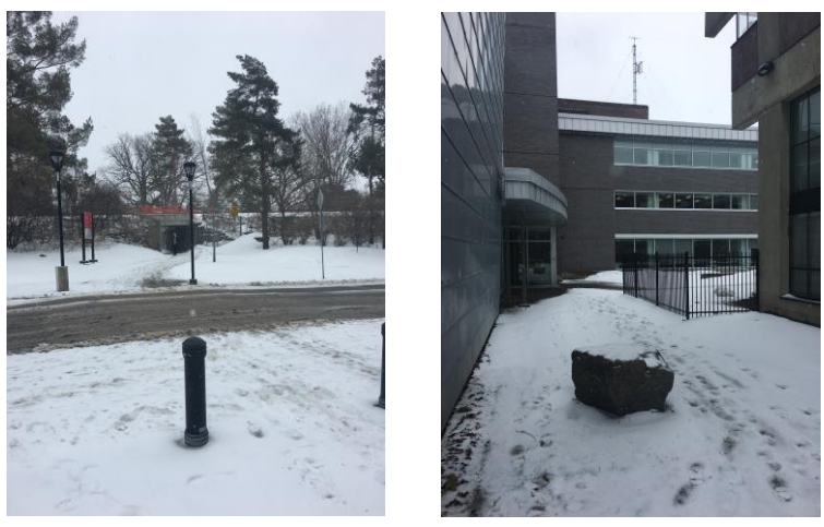
Carleton University safety audit locations, 2018

This audit was made possible with the participation of the Carleton University Security Department, students, staff, faculty, and administration. We can look forward to several new safety improvements to the campus through this partnership.